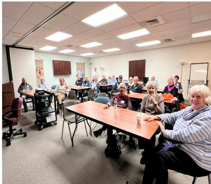
Senior Club Monthly Meeting

For anyone experiencing domestic violence in any form, be it physical, psychological, or sexual, there is help: you are not alone. Illinois Domestic Violence Hotline 877-863-6338 Catholic Charities Counseling 312-655-7725