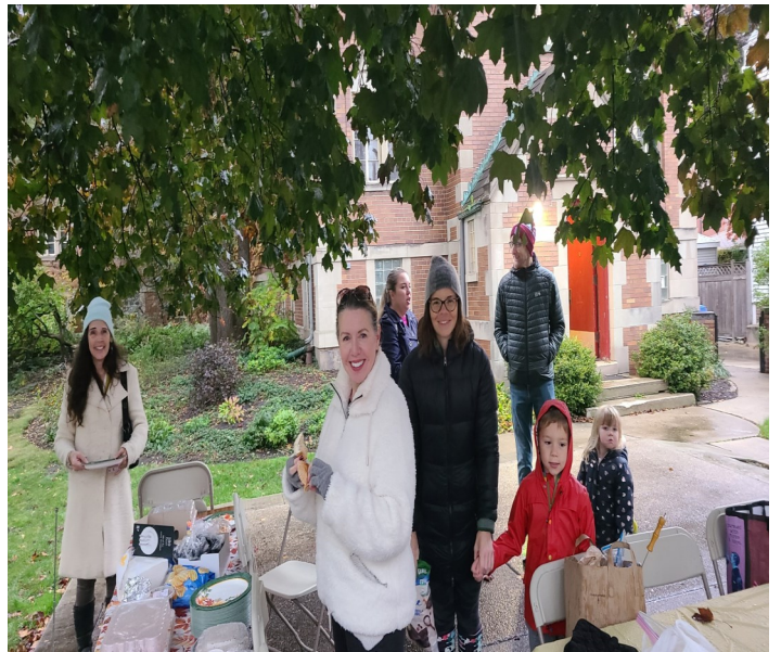
Saying goodbye to St. Matthias Rectory with fellowship and a cook out!