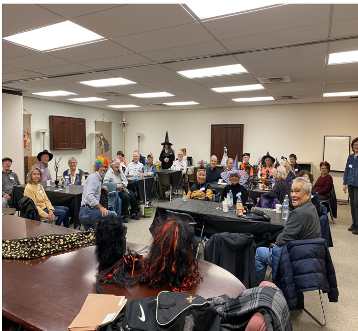
Senior Social Club Halloween Party!