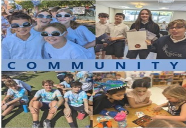
THINK • ACT • SERVE