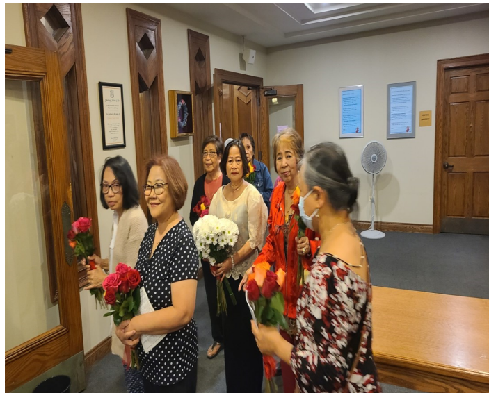
Kudos to the Filipino community on their Novena in honor of Our Lady of Penafrancia. It was an honor to celebrate their last day Saturday night.